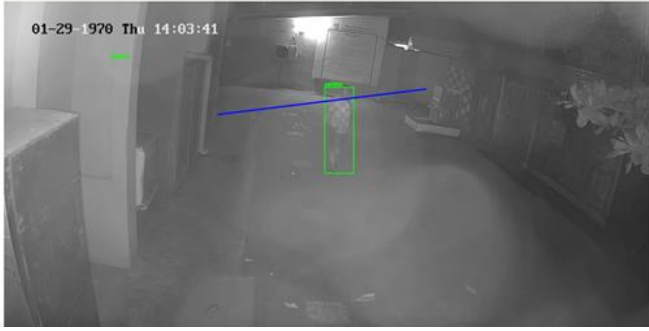
The video analytics solution has identified a person.

A major benefit of inq's solution is that it is completely based on software and agnostic to camera hardware, making it possible to use any IP camera. Even existing cameras can be connected to the solution, leveraging investments and installations.